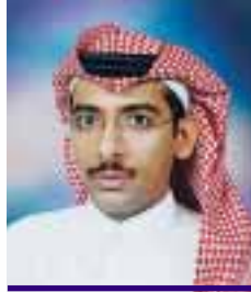
General Manager Al-Nakheel Paper Industries Company

Al-Nakheel Paper Industries Company is regarded as the first Saudi company, specialized in paper field, which participates in this international exhibition and which is regarded as the largest international exhibition in the world specialized in printing and paper fields. It is held every five years. This exhibition is especially