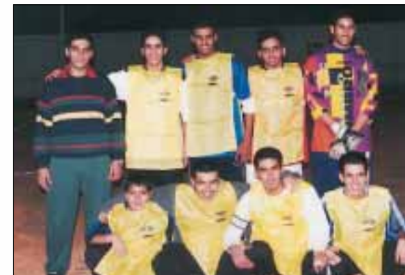
A group picture of the A.I. Alkhorayef Sons Co. team, winner of the ideal team trophy.