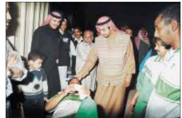
Slightly injured player.