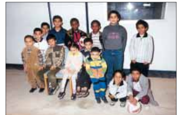
Children of participants in the tournament.