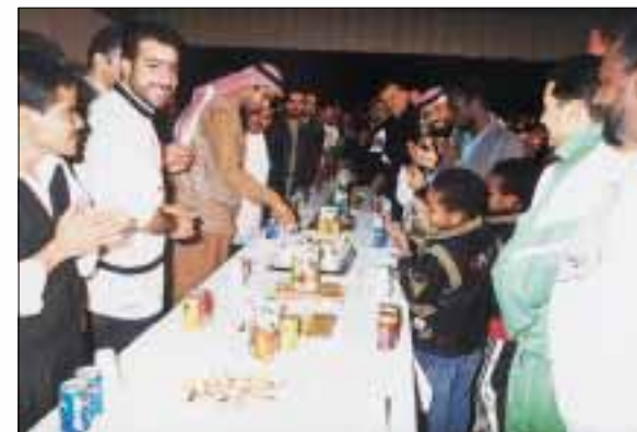
The tea party, held at the end of the match.