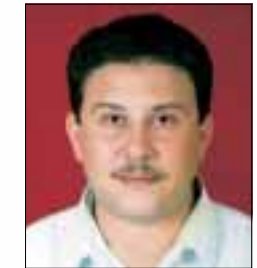
By Khalid Bayomi

portant to all types of engines. Its main function is to control the quantity of water flowing by means of cooling liquid temperature. It has several temperature degrees, which are chosen by the manufacturer based on the ambient atmosphere temperature.