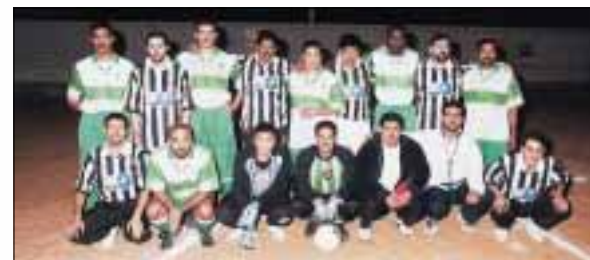
Trans Orient Modern Machinery Company team and Al Nakhil Paper Industries Company team, met in the final match.